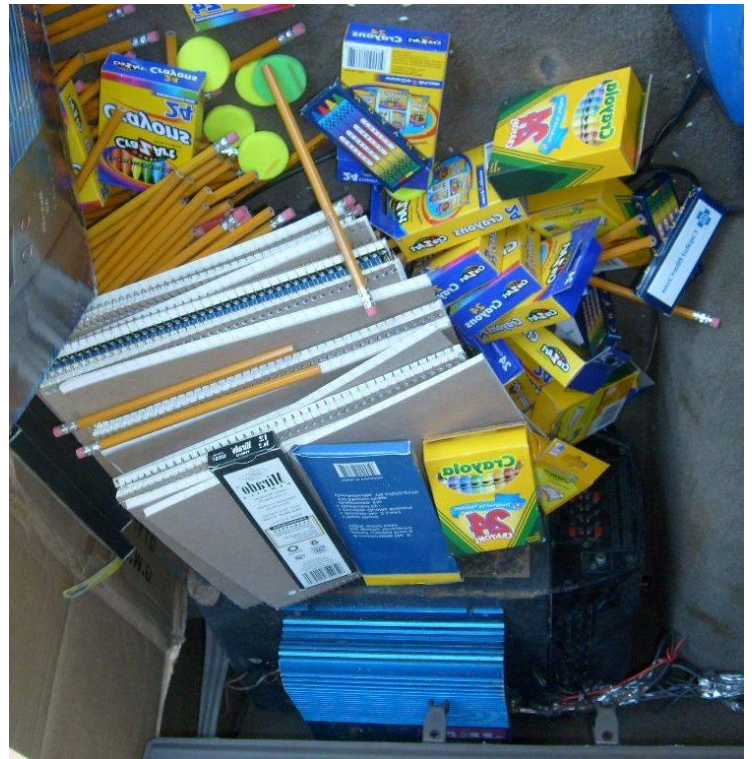
Teachers are happy to receive supplies too!