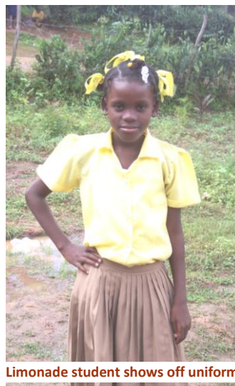
Limonade student shows off uniform

What a blessing the past two months have been for us helping the churches prepare for the start of school. Recent activities include preparing schools for new students, planning and budgeting for delivering donated school time talking to the many Hope Center with the hope receive help for their Scholarship Fund. This support we have added our program—L'Ecole d'Amour in Bas-de-Sault in L'Ecole Baptiste de